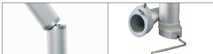
Joint for beach umbrella